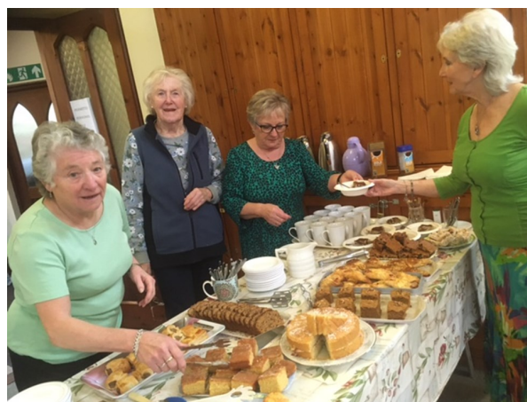
Tuesday Tunes Helpers

We have many other activities – please see our website – felixstowe.methodistic.org.uk – for the full list.