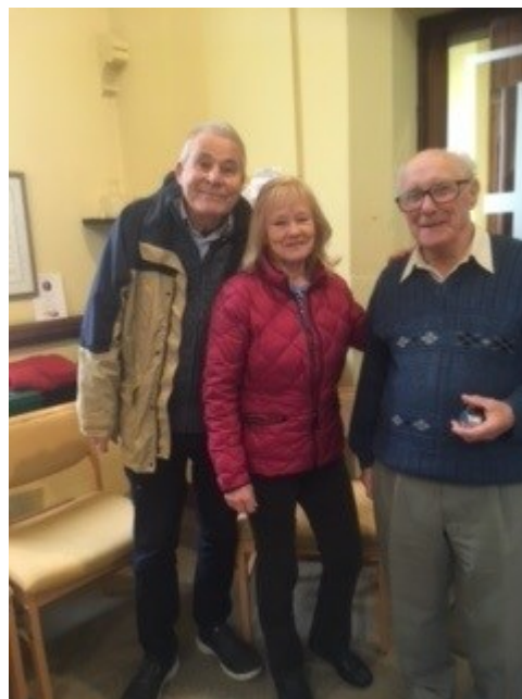
Tuesday Tunes Helpers

invited to give a donation towards church funds and the local Basic Life Charity. After thirty sessions, over £6,000 has been donated which has been split 50/50 between the church and Basic Life Charity. Each week a band of willing volunteers make cakes, serve refreshments and give a warm welcome to all attending. People are so grateful for the