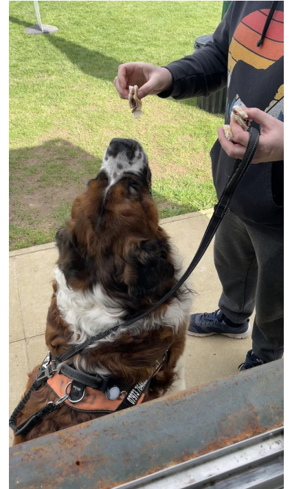
Red Devils Spectator

January and March. This is a hugely popular event where 100+ people come along each week to enjoy refreshments, chatter, fellowship and music. There is no charge, although people are