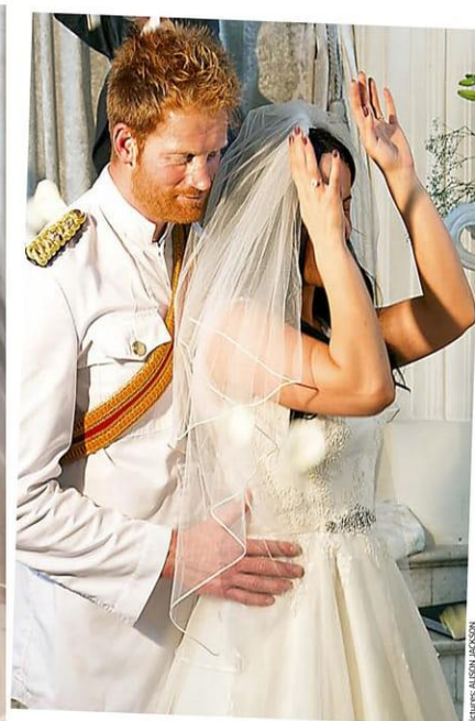
Man and wife: Harry holds Meghan lovingly after she throws her bouquet