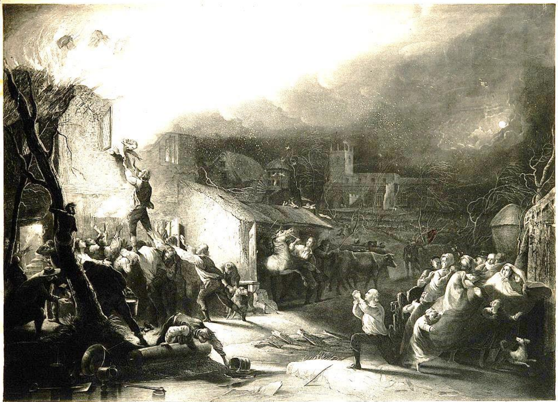
S W Reynolds